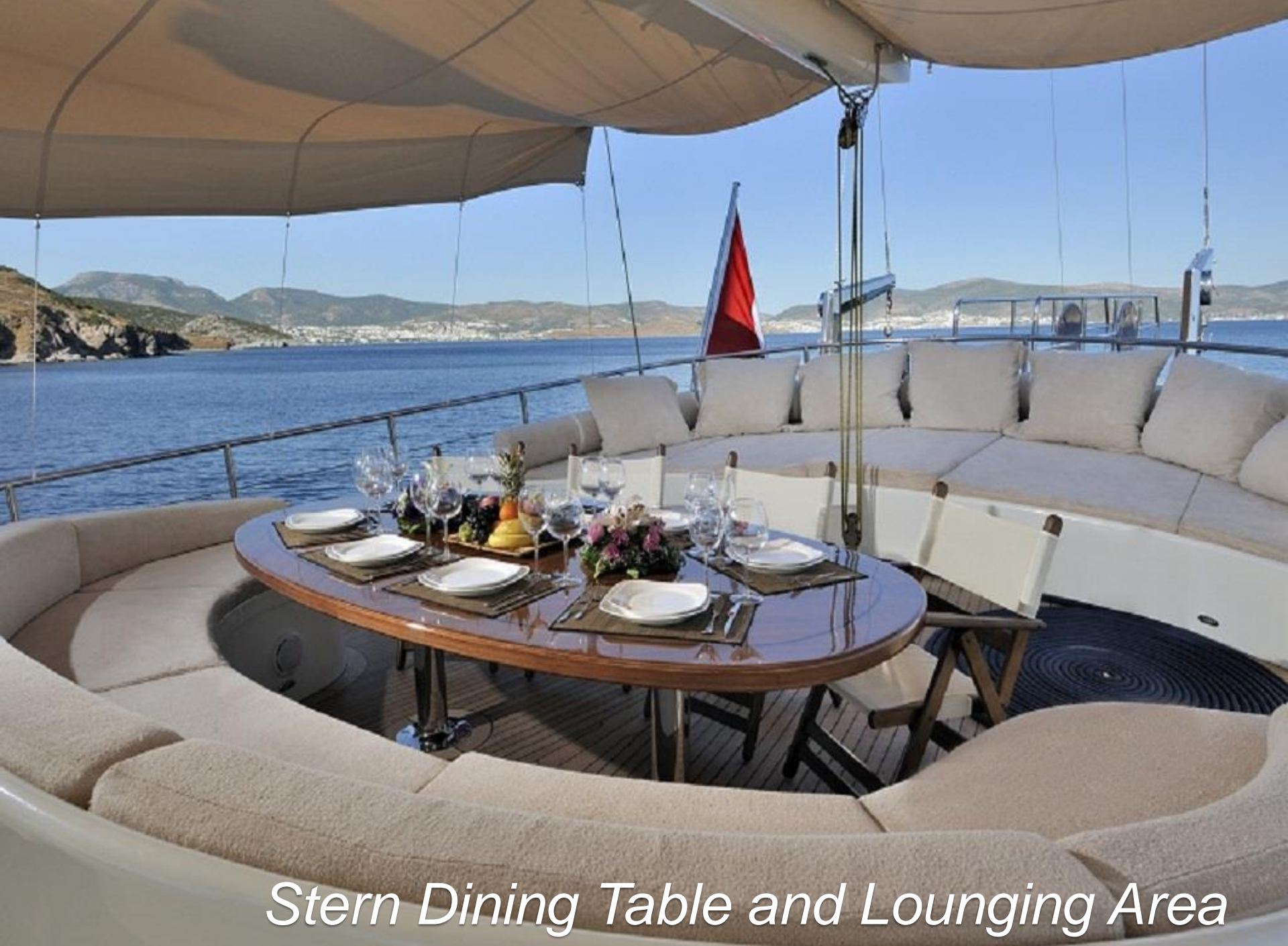
Stern Dining Table and Lounging Area