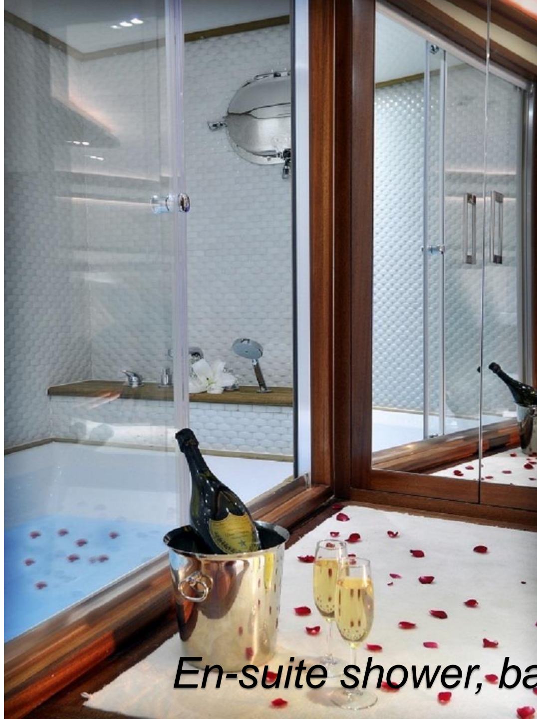
En-suite shower, bath, head