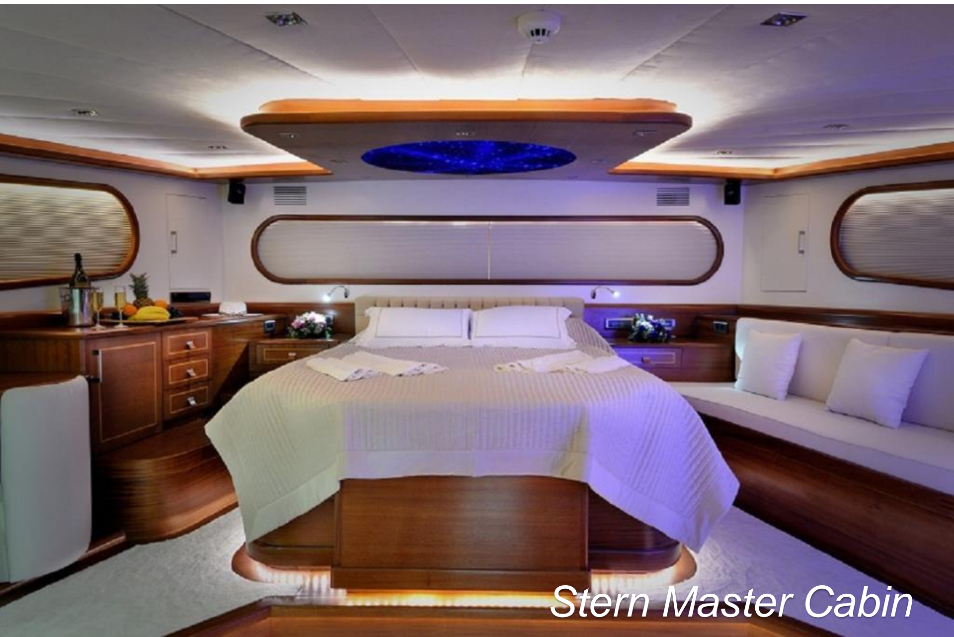
Stern Master Cabin