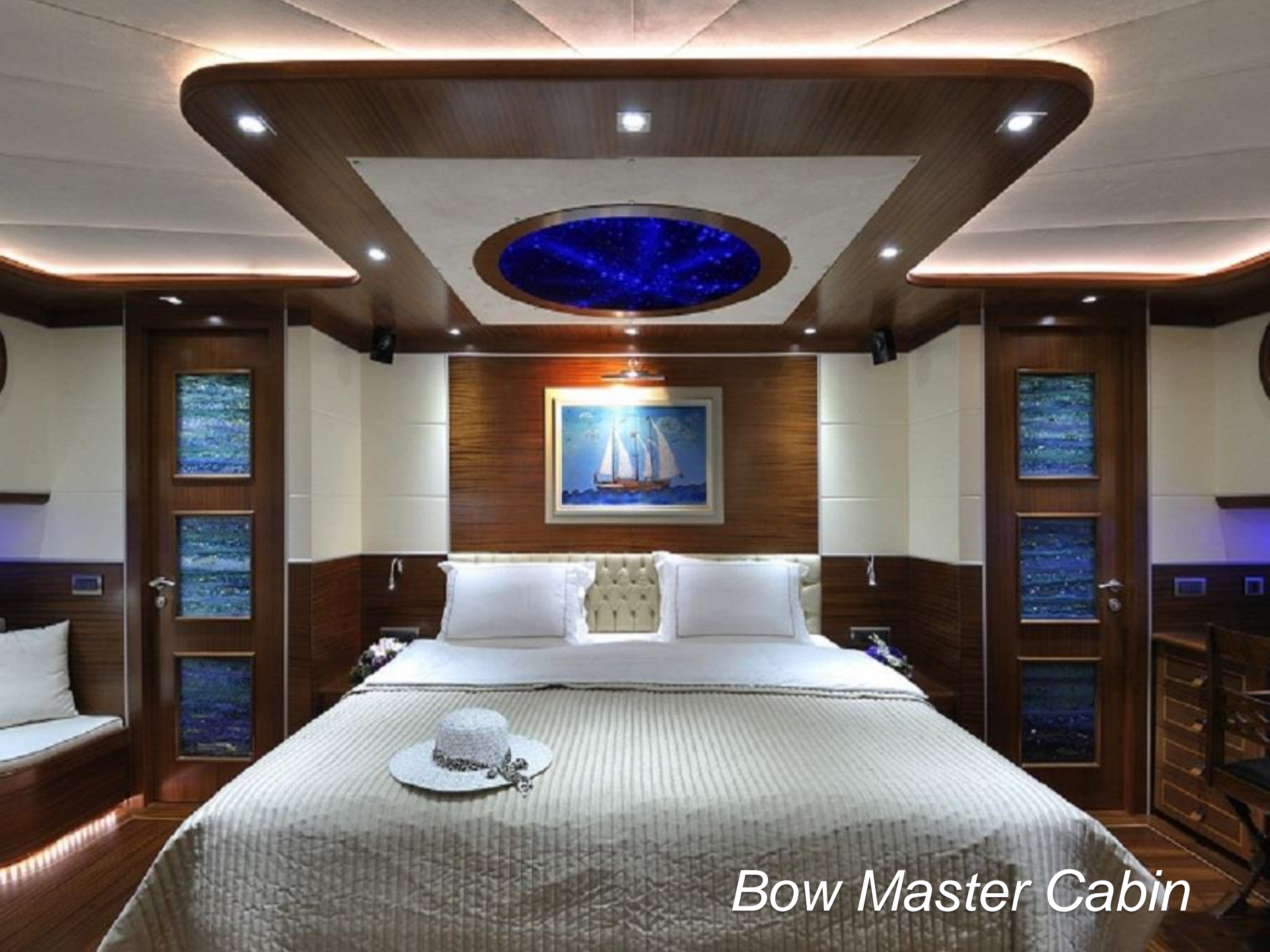
Bow Master Cabin