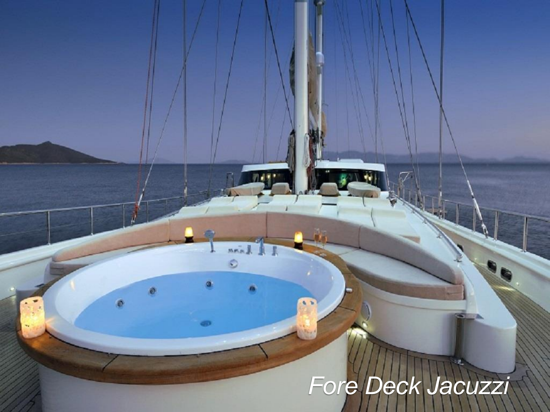
Fore Deck Jacuzzi