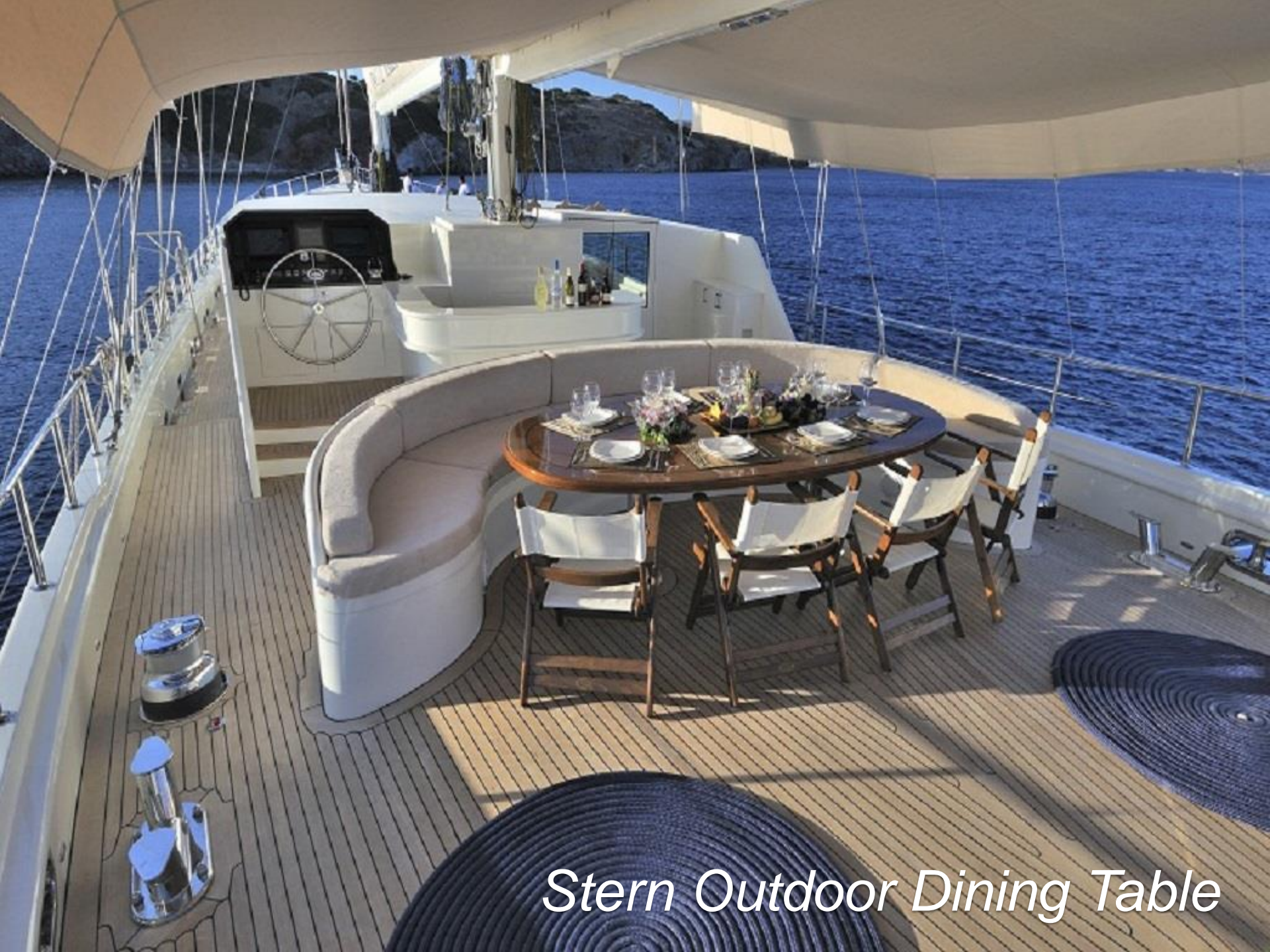
Stern Outdoor Dining Table