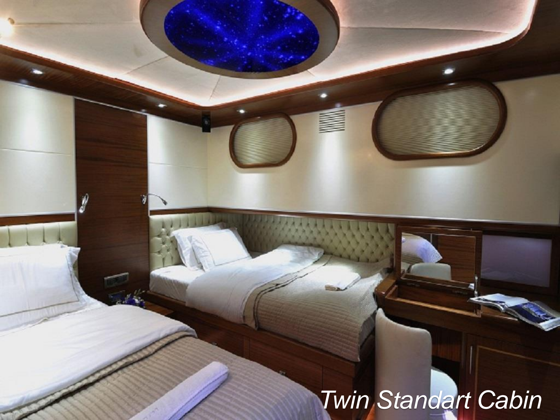
Twin Standart Cabin