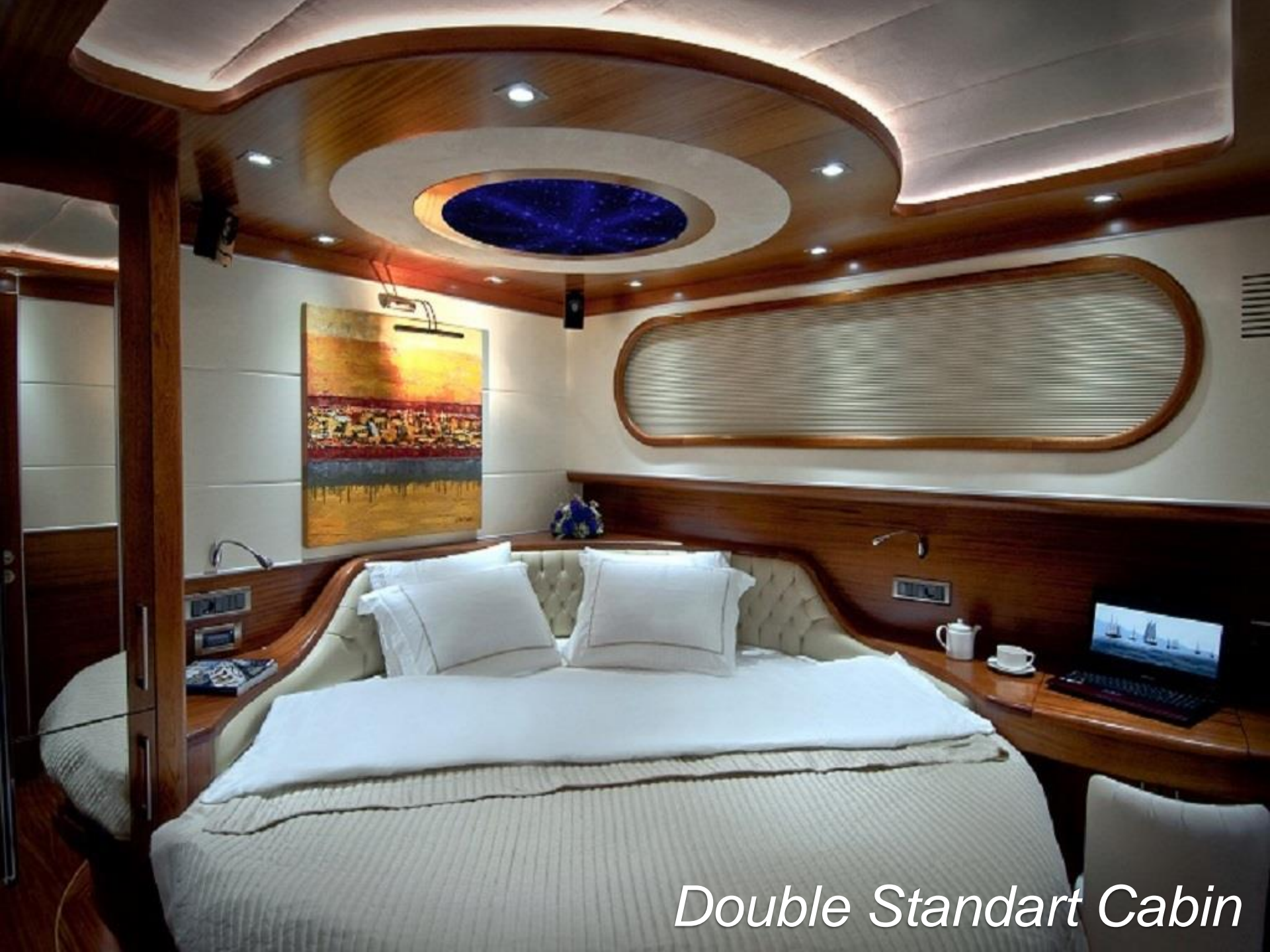
Double Standard Cabin