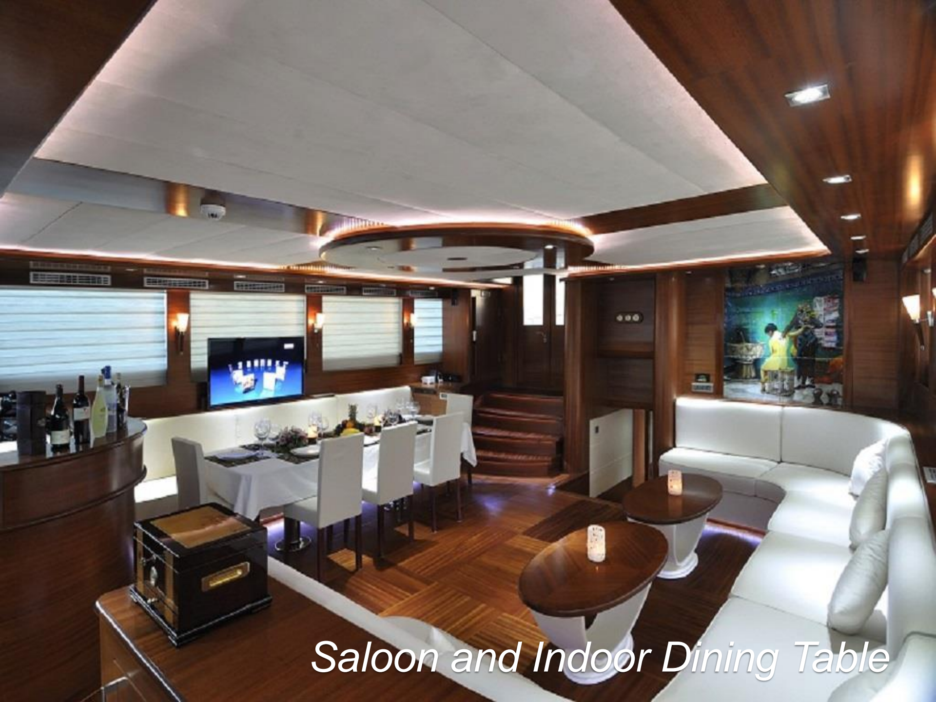
Saloon and Indoor Dining Table