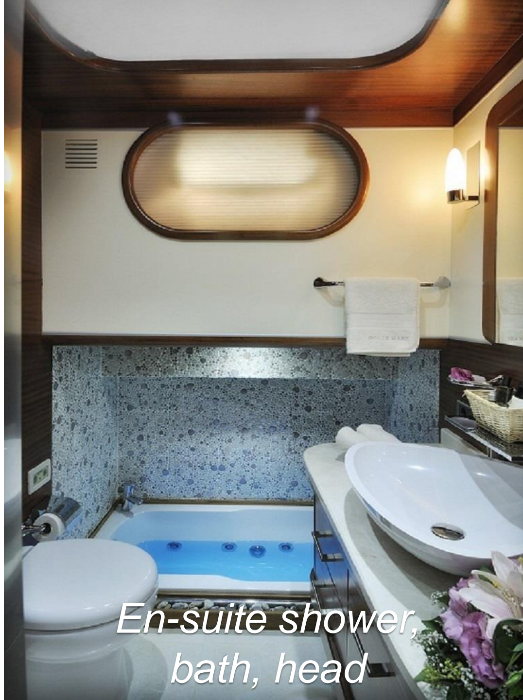
En-suite shower, bath, head