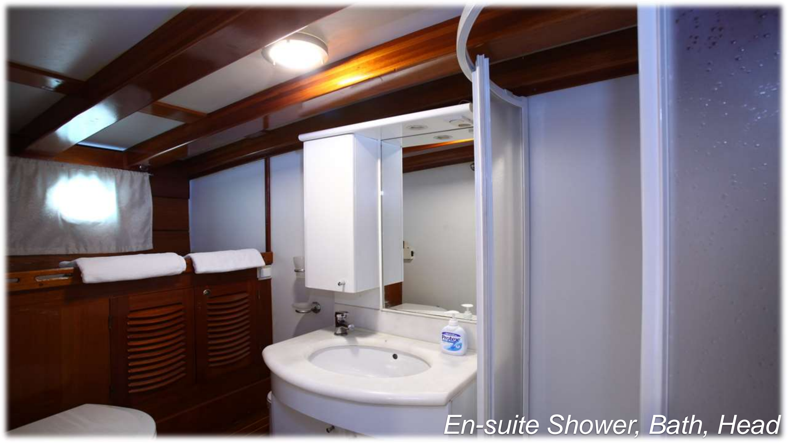
En-suite Shower, Bath, Head