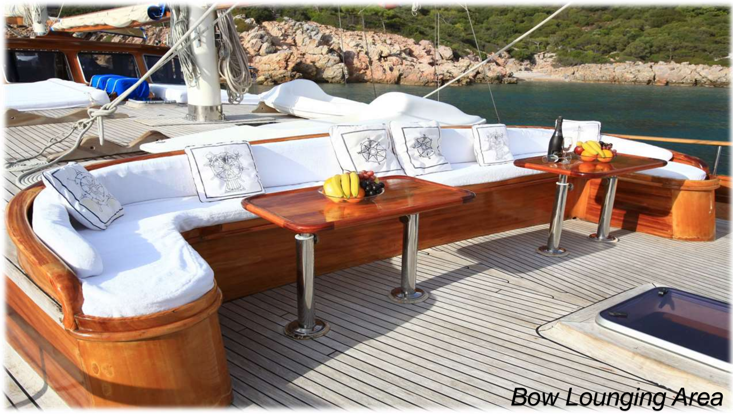
Bow Lounging Area