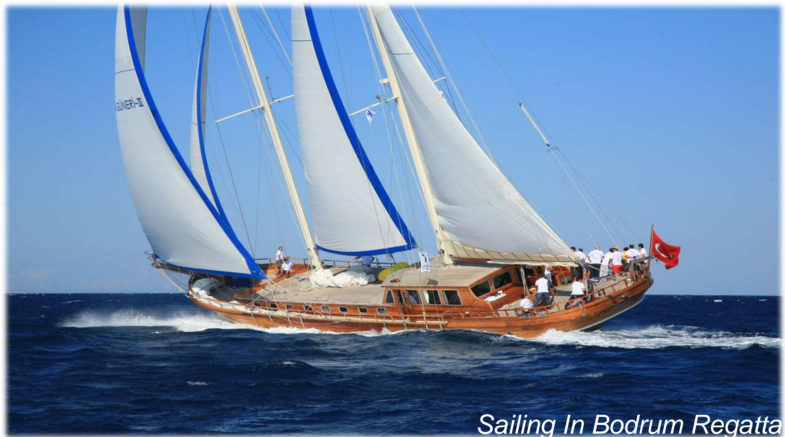
Sailing In Bodrum Regatta