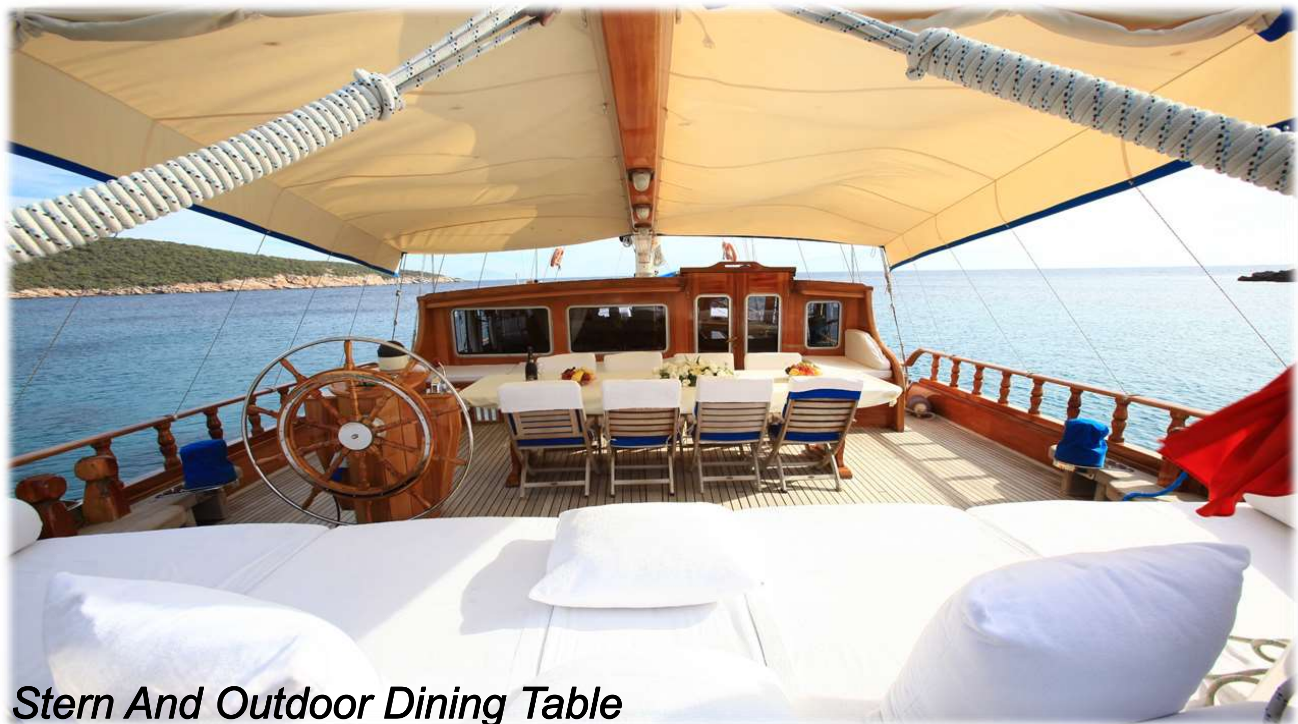
Stern And Outdoor Dining Table