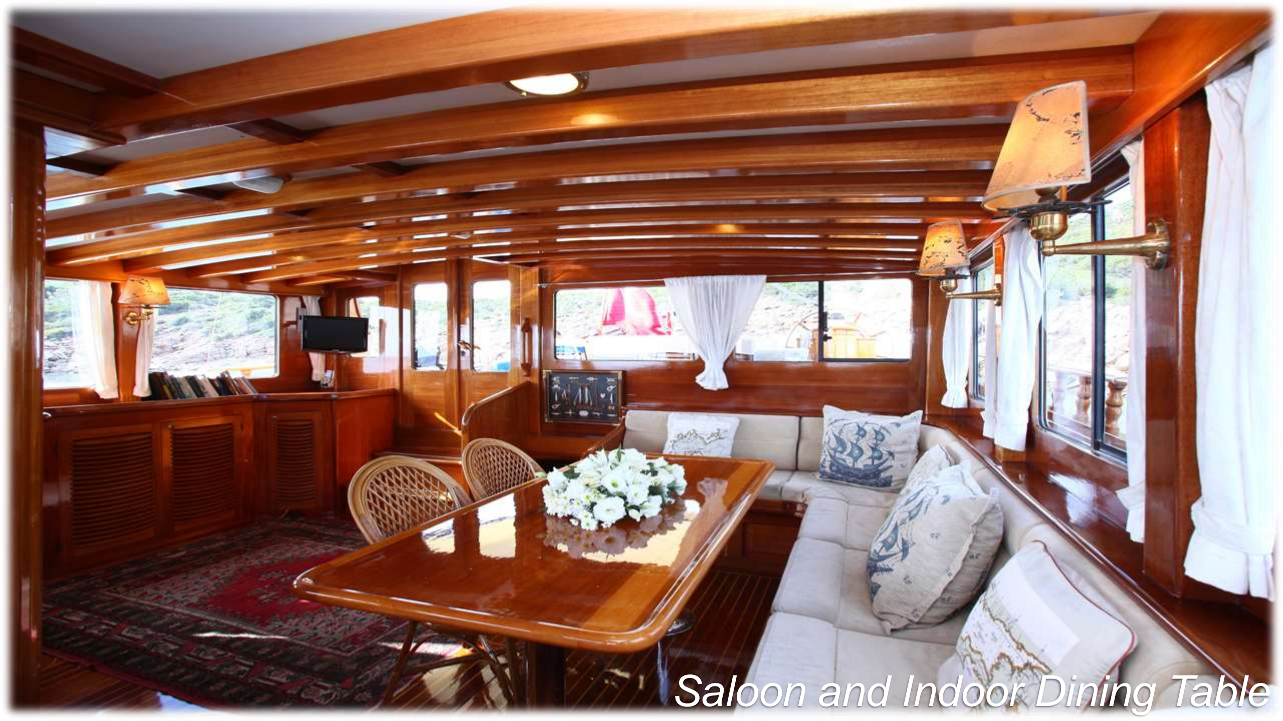
Saloon and Indoor Dining Table