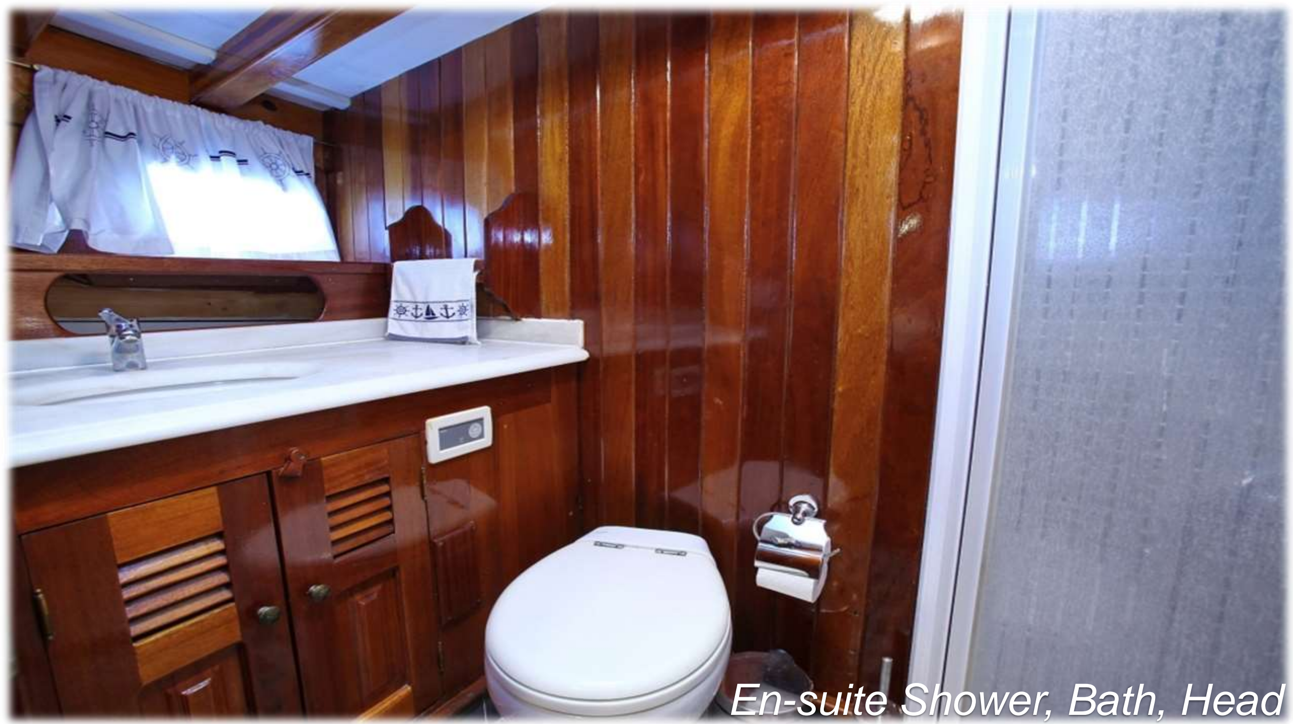
En-suite Shower, Bath, Head