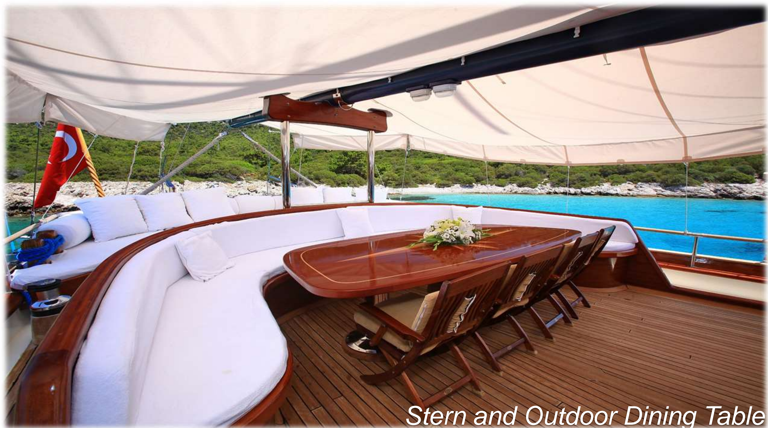
Stern and Outdoor Dining Table