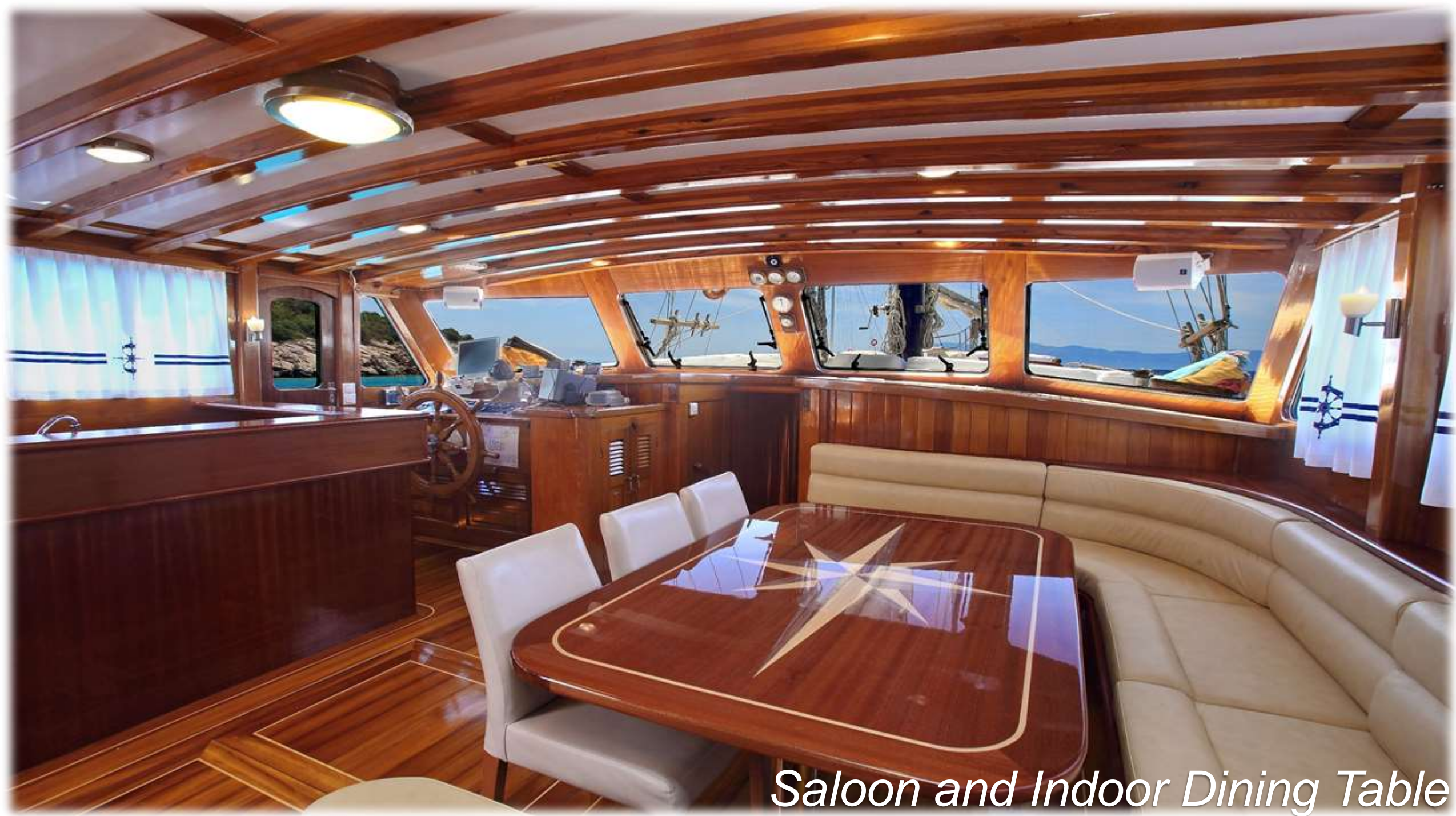
Saloon and Indoor Dining Table